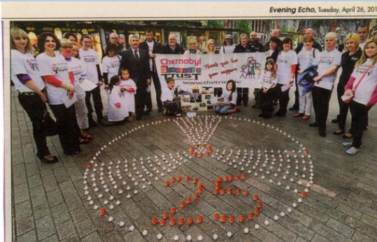
The Chernobyl Children's Trust mark the 25th anniversary of the Chernobyl nuclear disaster, at a candle lighting ceremony at Patrick Street.

On the 25 th Anniversary these actions were